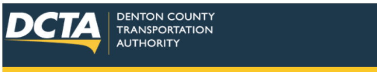
Exhibit 2: DCTA Public Meeting Notification